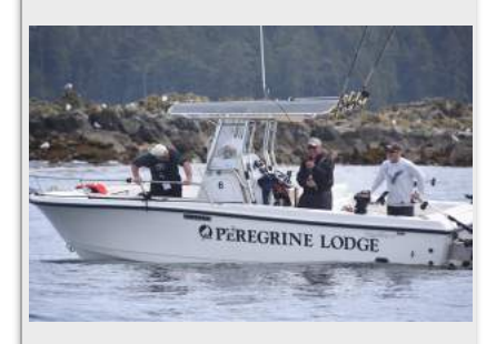
24' Trophy Upgrade