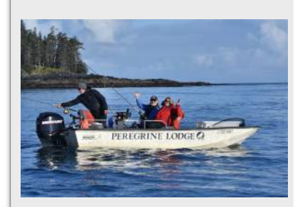
23' Edgewater Upgrade