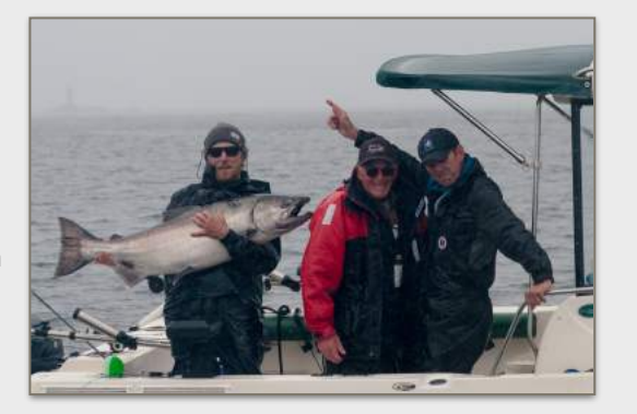
Caught June 22-26, 2016