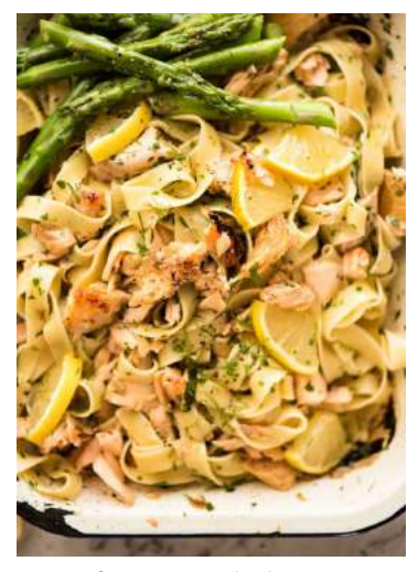
Recipe from www.spendwithpennies.com