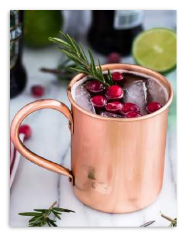
Recipe From www.hotbeautyhealth.com